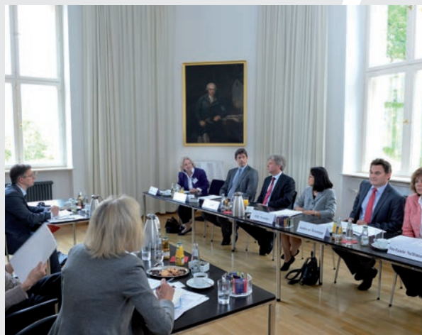
l: Press meeting at the Annual Conference (11/12/2013), r: Press conference at the founding meeting (05/07/2013)