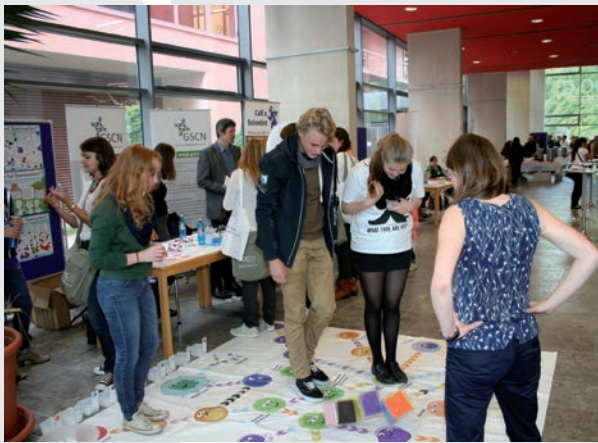
GSCN information booth and stem cell game from EuroStemCell at the 60 Years of DNA event for teachers and students